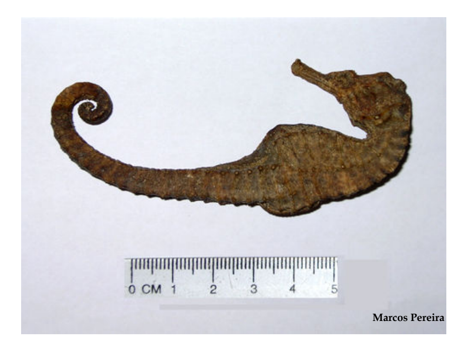
Figure 3. Seahorse from Inhaca island, sold as souvenirs by local women.