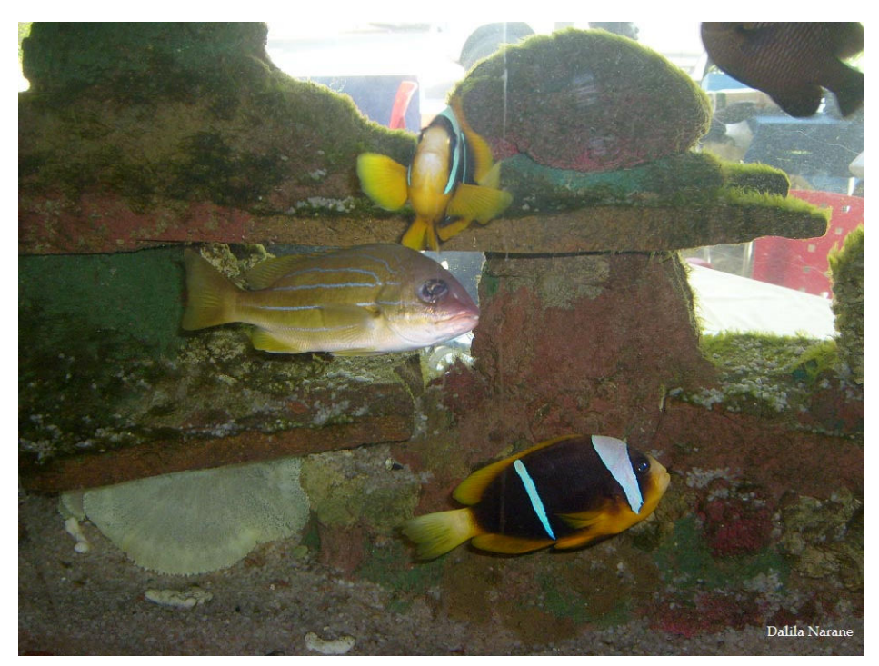
Figure 2. Reef fishes displayed at a restaurant aquarium in Maputo.

Figure 1. Distribution of coral reefs in Mozambique (adapted from Rodrigues et al. , 2000). Red line represent subtidal rocky reef colonized to a varying degree by coral colonies, while green line represent true (biogenic) coral reefs. Dots represent locations were questionnaires were received from. From north to south: (1) Vamizi island and Quilalia; (2) Pemba; (3) Bazaruto Archipelago/Cabo de São Sebastião; (4) Tofo and Paindane; and (5) Ponta do Ouro.